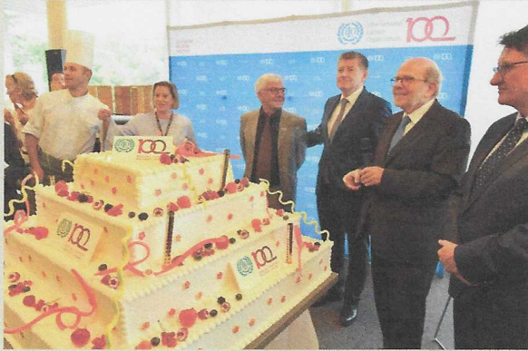
Centenary lunch 11 July 2019